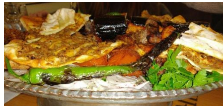
First diner at "Diyarbakir Ocakbaşı"